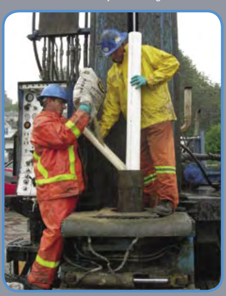
Pouring filter sand through temporary