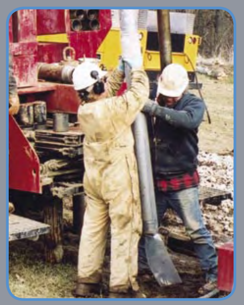
Installing poly core bag over core barrel prior to core extraction.