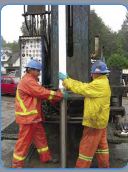
Installing stainless steel well screen with PVC riser pine.