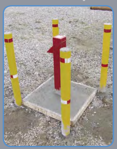
Finished observation well.