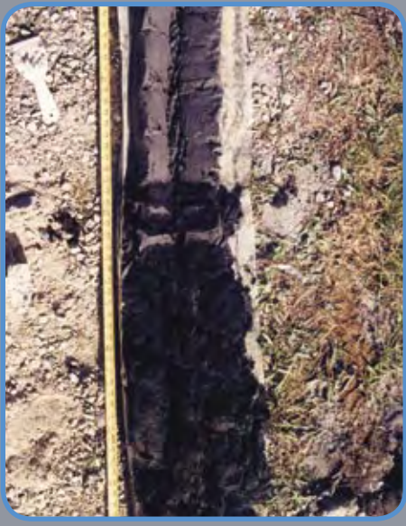
Continuous core sample showing interface between sand aquifer and confining clay layer.