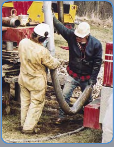
Extruding core sample using vibratory action.